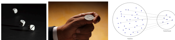
Figure 1: Throwing dices, tossing a single coin and sampling from a population, all are examples of random experiment!